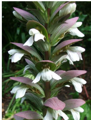
Flowering acanthus plant