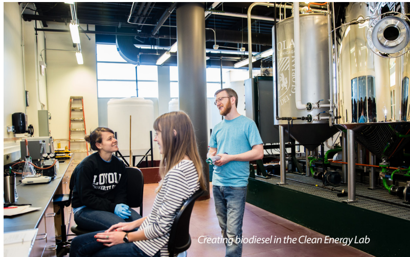
Creating biodiesel in the Clean Energy Lab