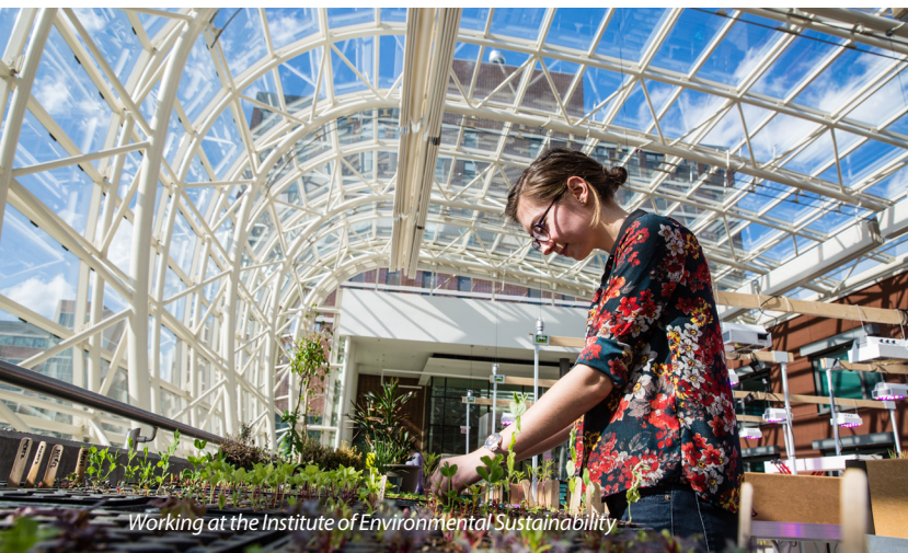
Working at the Institute of Environmental Sustainability