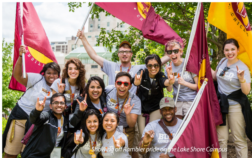
Showing off Rambler pride on the Lake Shore Campus