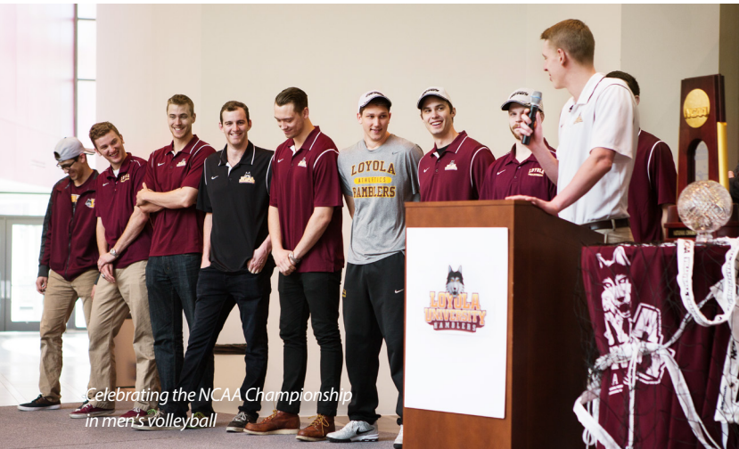
Celebrating the NCAA Championship in men's volleyball